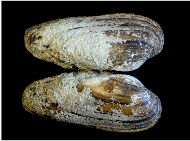
Fig. 1. Shells of the painter's mussel, Unio pictorum , from the Mrežnica River in the pericardial cavity of which three adult specimens of Aspidogaster conchicola were found (shell length = 8.51 cm).

ut 2 km upstream from the town of Duga Resa, in the lower section of the Mrežnica River and represented the site with low anthropogenic influence (45° 26' 28.40" N, 15° 30' 15.39" E). Detailed information on the geographical characteristics of the section of the Mrežnica River studied, as well as hydrological and physico-chemical data referring to the time of mussel sampling were presented in paper of DRAGUN et al. (2022). Most importantly, the measurement of several physico-chemical parameters and nutrients in the surface water along the lower course of the Mrežnica River in 2021 indicated its rather good quality (DRAGUN et al. , 2022).