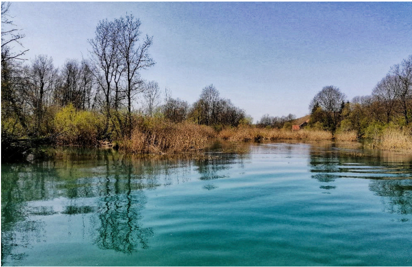
Fig. 3. Researched location in the Mrežnica River.

The use of mussels for this study was in accordance with the Ordinance on the protection of animals used for scientific purposes (NN 55, 2013). The samples of U. pictorum were collected by scuba-diving in early October 2021. Altogether five mussels were transported to the laboratory in dark and cool containers where they were deparated 24 h prior to dissection. The dissection of mussels was carried out in the laboratory of the Department of Zoology (Faculty of Science, University of Zagreb) and all tissues were inspected under a stereo microscope Olympus SZ61. Determination of the parasite A. conchicola was performed based on the number and arrangement of alveoli (MICHELSON, 1970).