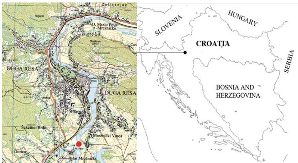
Fig. 2. Map showing the sampling site (red circle) in the Mrežnica River near the town of Duga Resa.

ut 2 km upstream from the town of Duga Resa, in the lower section of the Mrežnica River and represented the site with low anthropogenic influence (45° 26' 28.40" N, 15° 30' 15.39" E). Detailed information on the geographical characteristics of the section of the Mrežnica River studied, as well as hydrological and physico-chemical data referring to the time of mussel sampling were presented in paper of DRAGUN et al. (2022). Most importantly, the measurement of several physico-chemical parameters and nutrients in the surface water along the lower course of the Mrežnica River in 2021 indicated its rather good quality (DRAGUN et al. , 2022).