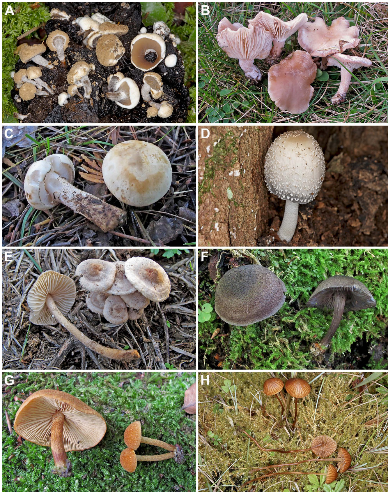
Fig. 1. Basidiomata in the field. A. Asterophora lycoperdoides ; B. Calocybe carnea ; C. Chamaemyces fracidus ; D. Coprinopsis mitrispora ; E. Crinipellis subtomentosa ; F. Entoloma euchroum ; G. Flammulaster limulatus ; H. Galerina vittiformis.