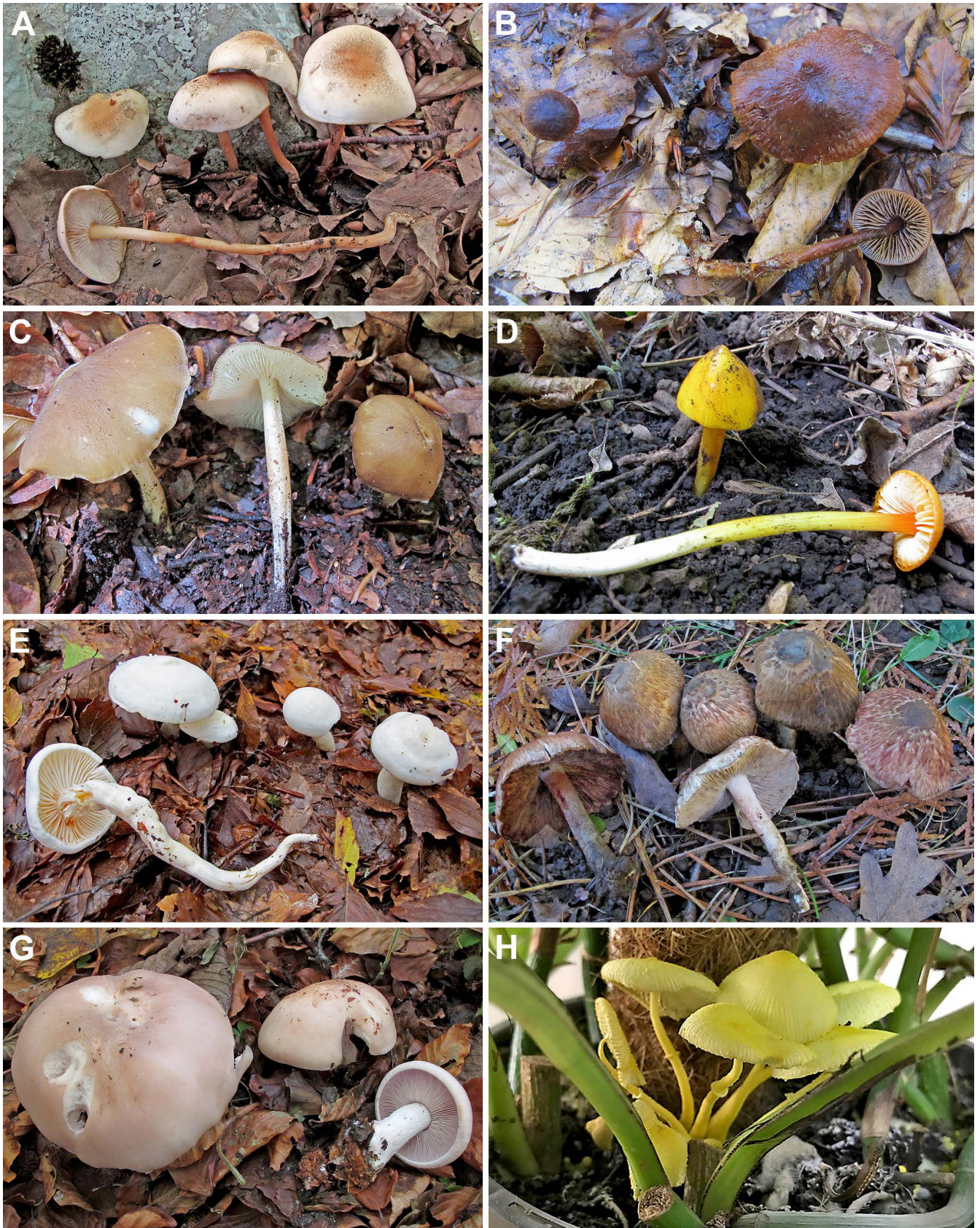
Fig. 2. Basidiomata in the field. A. Gymnopus aquosus ; B. Gymnopus fuscopurpureus ; C. Hydropus subalpinus ; D. Hygrocybe acutoconica ; E. Hygrophorus discoxanthus ; F. Inocybe haemacta ; G. Lepista glaucocana ; H. Leucocoprinus birnbaumii . Photos: A–H I. Četković.