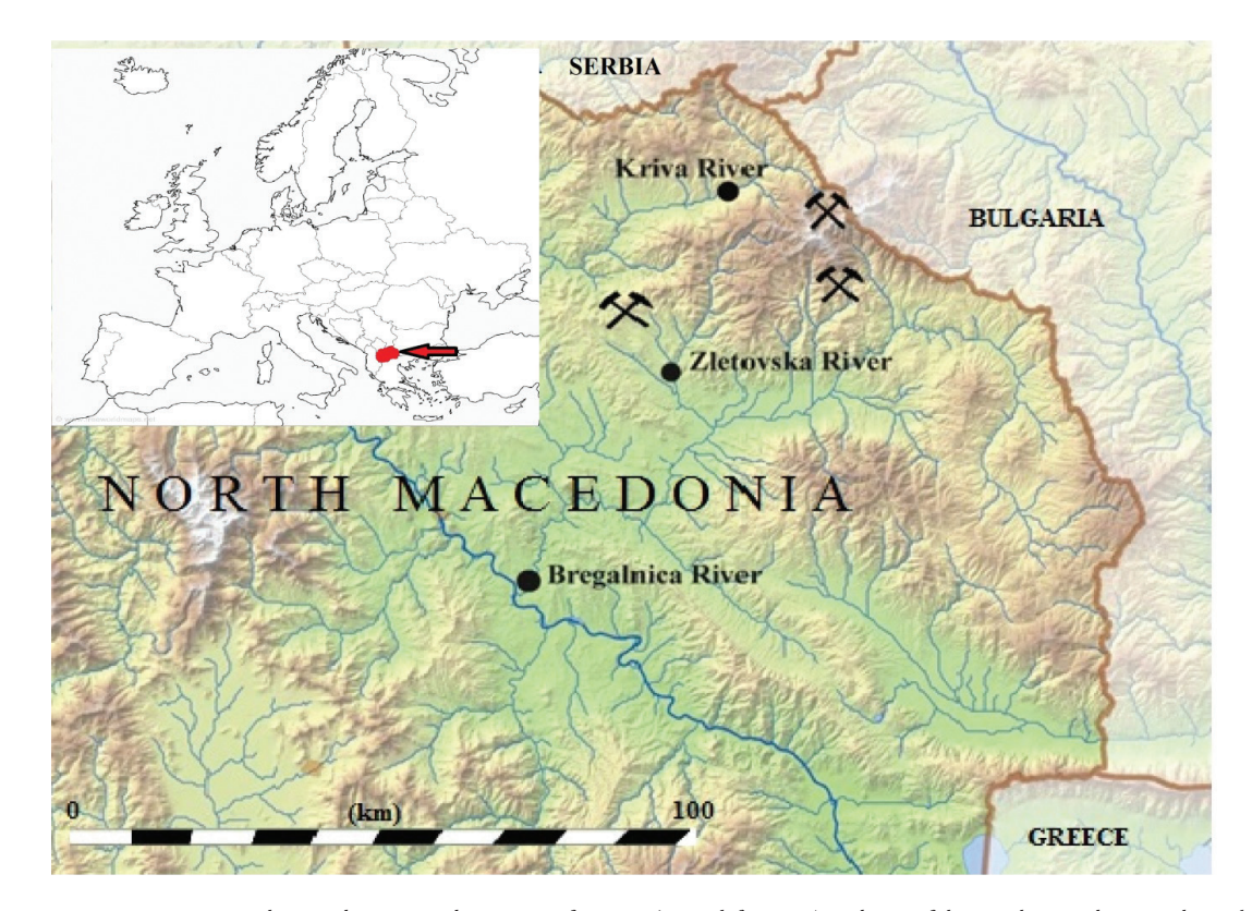
Figure 1. Maps representing North Macedonia in wider context of Europe (upper left corner) and part of the North Macedonia with marked sites of collection (black circles) and their proximity to mines (right)

After capture, fish were transported to the laboratory in oxygenated tanks. Shortly before dissection, fish were euthanized with Clove oil (Sigma) and their body masses (BM) and total lengths (TL) were measured. Scales were also collected, and the fish age was determined according