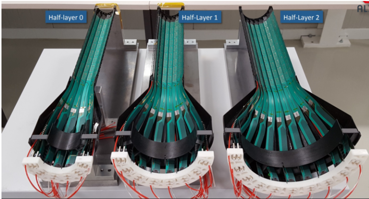
Fig. 1. Photograph of the upgraded ITS inner half-layers