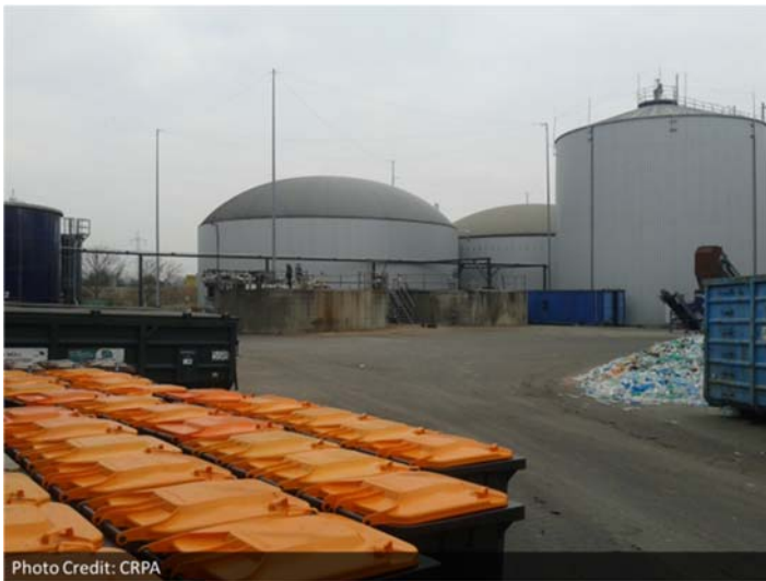
Figure 6.2 Waste biogas plant.

Waste BGP (Figure 6.2) are involved in the processing of biological degradable wastes (BDW). BDW is a raw material from various origins and substrate compositions, including the organic fraction of municipal wastes (OFMW), waste from the food industry, retail trade (expired food), certain agricultural waste, sludge from wastewater treatment plants, etc. (Usták et al. , 2004). The substrates used in these reactors exhibit non-homogeneous properties. Moreover, they can contain impurities, pathogens, trace metals, some organic pollutants and micro-organic pollutants which create waste management concerns. These concerns limit the potential uses of the digestate as a soil conditioner or fertilizer.