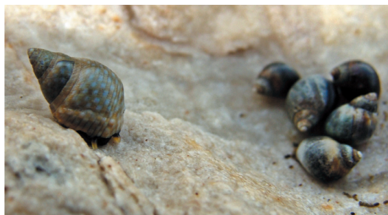
Fig. 2. Photograph of E. punctata specimen taken in situ together with cluster of five specimens of Melarhaphé neritoides

The heights of the specimens collected in August 2014 and October 2014 ranged from 6.0 to 10.7 mm (mean 7.86; stdev \pm 1.73 mm) and their widths ranged from 4 to 7.6 mm (mean