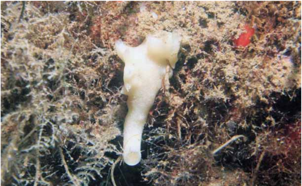
Fig. 3. Paraleucilla magna in the fouling benthic community in the harbour of Ploče in the eastern Adriatic Sea

In June 2011 only one specimen of P. magna